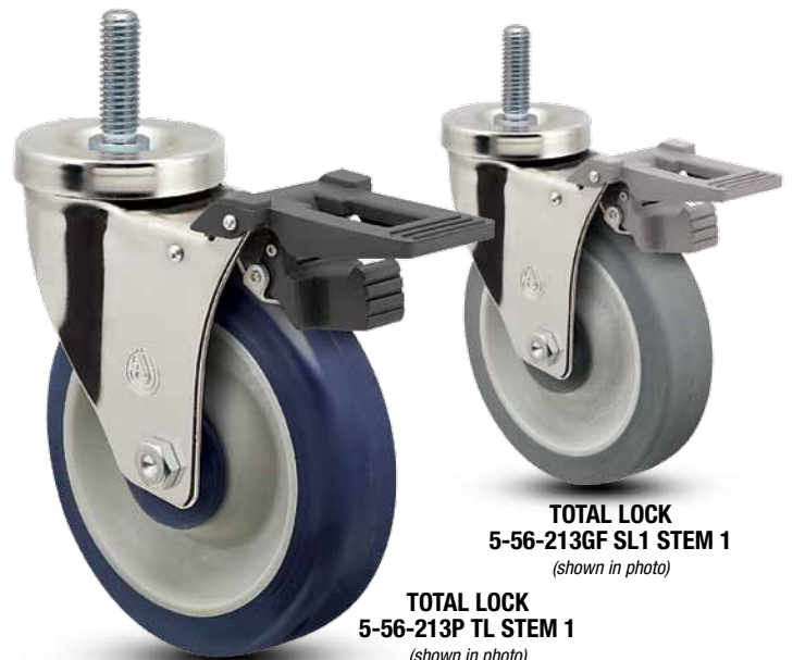
TOTAL LOCK 5-56-213GF SL1 STEM 1 (shown in photo)