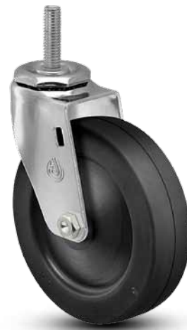
5-W13-105 STEM 1 (shown in photo)