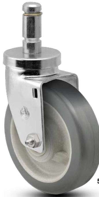
5-134-215G STEM 1 (shown in photo)