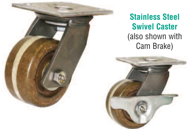
Stainless Steel Swivel Caster (also shown with Cam Brake)