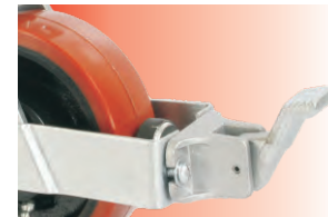
Wheel Face Break