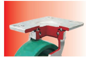
Swivel Head Section