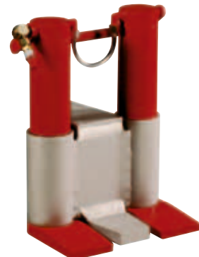
JH 50 P