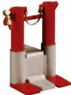
JH 30 P