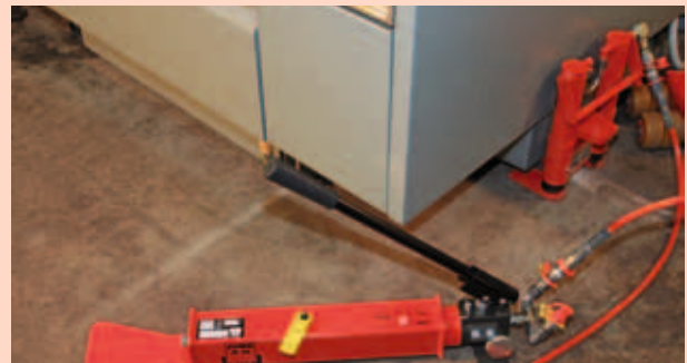
Application with „Primus“ and central pump

▶ Please refer to page 10 for hand pumps and hydraulic hoses, for electrical pumps to page 11.