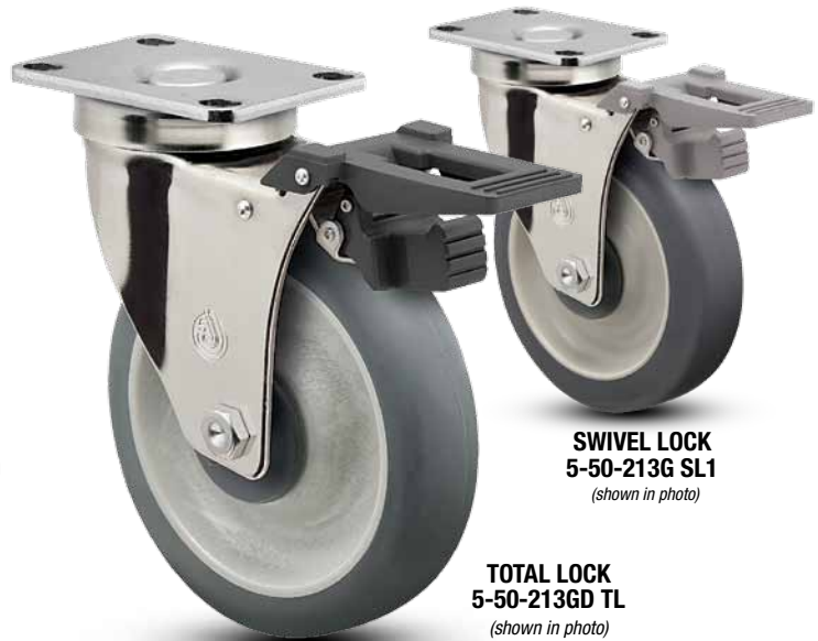
SWIVEL LOCK 5-50-213G SL1 (shown in photo)