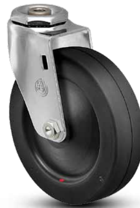
5-W28-105C (shown in photo)