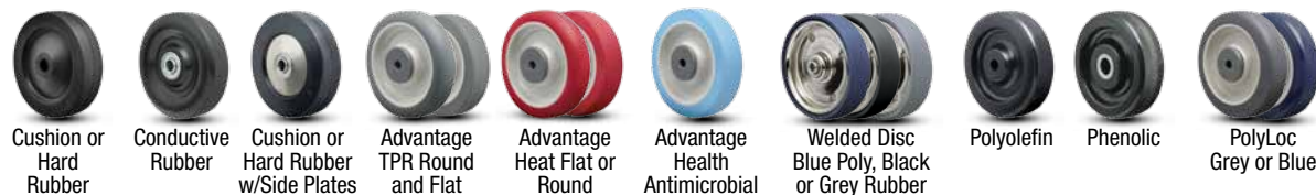
Cushion or Hard Rubber Conductive Rubber Cushion or Hard Rubber w/Side Plates Advantage TPR Round and Flat Advantage Heat Flat or Round Advantage Health Antimicrobial Welded Disc Blue Poly, Black or Grey Rubber Polyolefin Phenolic PolyLoc Grey or Blue