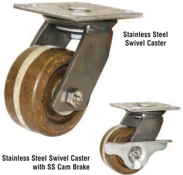
Stainless Steel Swivel Caster